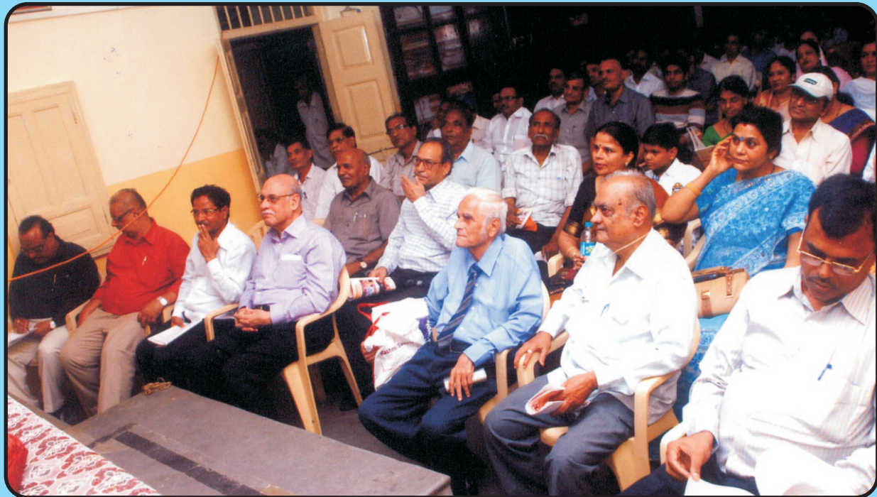
३२ वी वार्षिक साधारण सभा में बैठे हुए सदस्य गण